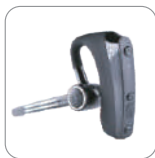
BT Earpiece with Dual-PTT