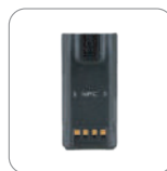
Smart Battery (4,000 mAh)