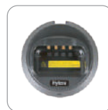
Charger (2 A)