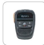
Wireless Remote Speaker Microphone