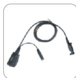
PTT & MIC Cable