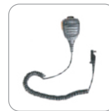
Waterproof Remote Speaker Microphone