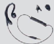
Optional C type earpiece EH-01

*: The band 320-380MHz can only use the 9cm long antenna.