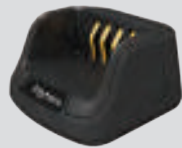
Standard Desktop Charger CH10L28