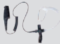
Optional Receive only earpiece with 11 pin connector EAS04