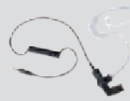
Optional Receive only earpiece with 3.5mm plug EAS05