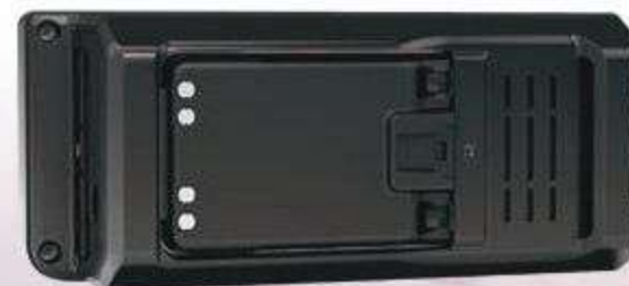
BP-272 attached (Rear panel view)

Utilizing the high capacity Li-ion battery from the ID-51A and ID-31A handheld radios. A 13.8 V DC external power supply can be used for operation and charging of the BP-272.