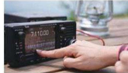
Touch screen display

The large 4.3" color TFT touch LCD, same size as the IC-7300 and IC-9700, offers intuitive operation of functions, settings, and various operational visual aids, such as the band scope, waterfall, and audio scope functions.