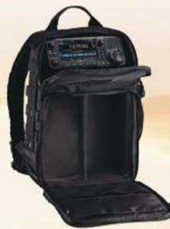
LC-192 Multi-function backpack

Designed to be the "Ultimate", must have accessory for the IC-705, the LC-192 is the perfect utility backpack. Features like a safety strap, with a 1/4"-20 mounting lug to keep the IC-705 from accidentally falling out of the custom radio compartment, to the user adjustable internal panels for custom compartments for antennas, battery packs, or other items necessary for an afternoon SOTA activation.