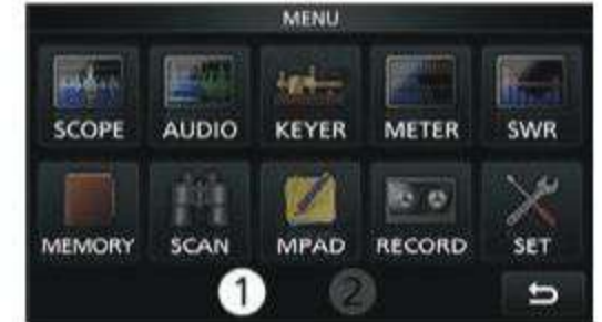
Menu screen example