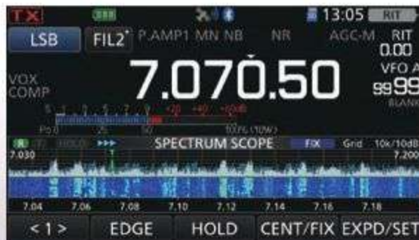
Display example of real-time spectrum scope and waterfall

Performance seen with the IC-7300 and IC-9700 spectrum scope is at the tip of your fingers for field operation. You can quickly see band activity as well as finding a clear frequency, all in the compact radio and not as an expensive add-on.