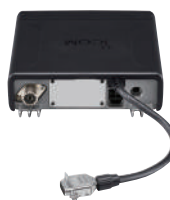
Optional OPC-1939 installation image