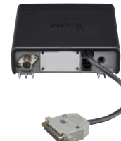
Optional OPC-2078 installation image