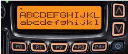
Two line setting display example.

With a high contrast dot matrix display, upper and lower case characters can be easily distinguished. You can change the display setting to show one line and 12 characters, or two lines and 24 characters via programming. LCD backlighting is standard.