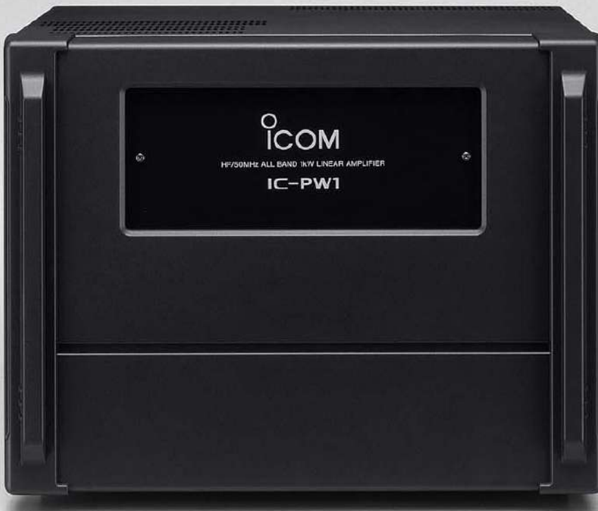
• Controller attached