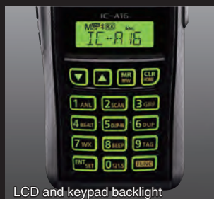
LCD and keypad backlight