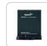
Battery (3000 mAh)