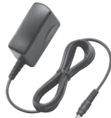
BC-199S* Charges BP-266 in 8.5 hours (approx.).